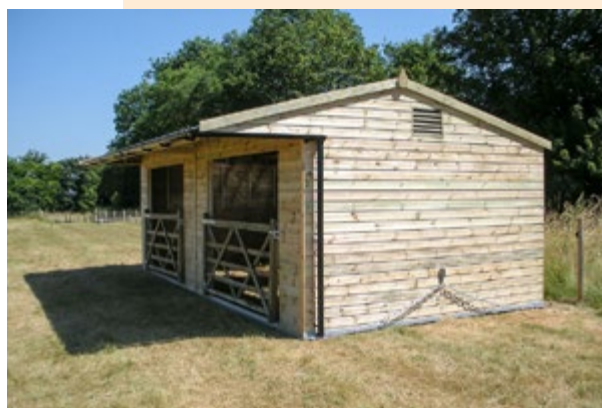
Double Mobile Field Shelter 24' x 12'