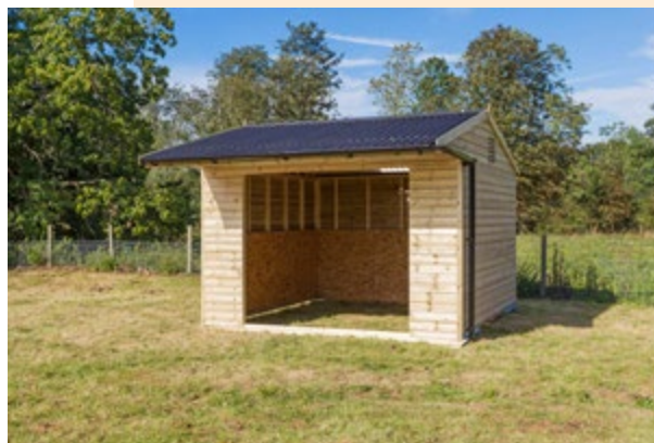
Single Mobile Field Shelter 12' x 12'

Coltstables.co.uk | 01746 766110 | Kent, TN23 4FH