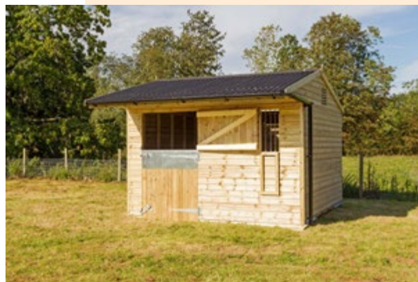
Single Mobile Stable