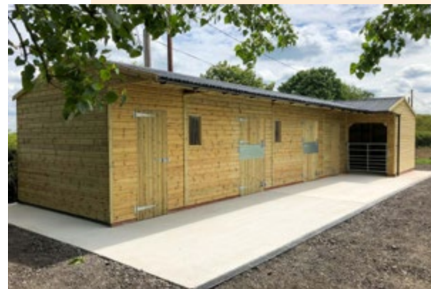
2 stables, 2 tack rooms and corner hay store