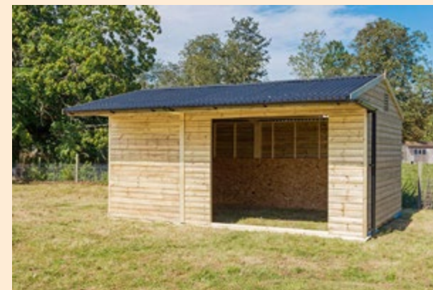
Large Single Mobile Field Shelter 18' x 12'