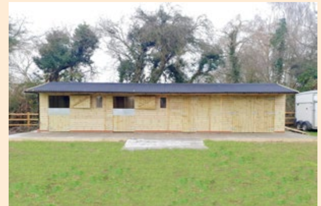
Straight line stables tack room & hay store