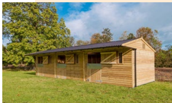
Triple Mobile Stable