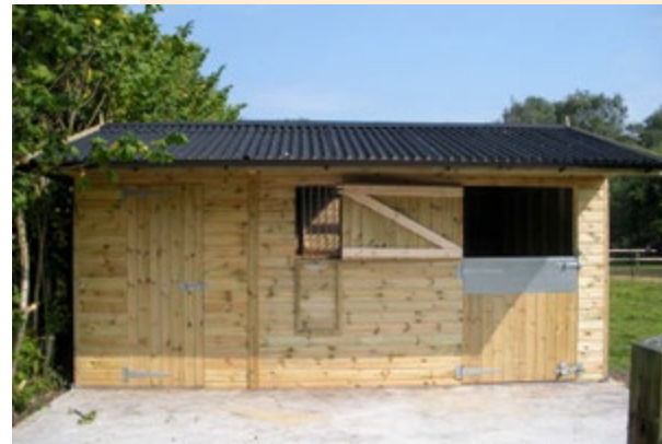
Single stable and tack room

Coltstables.co.uk | 01746 766110 | Kent, TN23 4FH