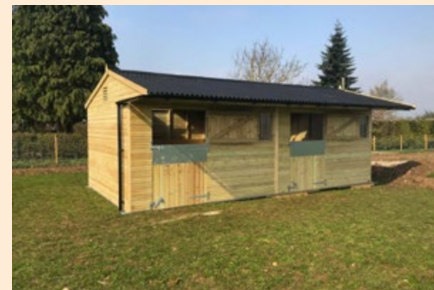
Double Mobile Stable